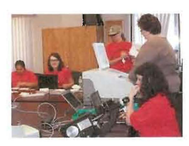
OneSight clinic Volunteers.

Kinsey models her new glasses secure in mom's arms.