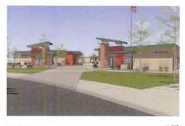
MPUS ENTRY NTA MARGARITA E.S. MODERNIZATION

The modernized Santa Margarita is expected to reopenfor the 2011/2012 school year.