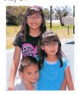
Traveled from San Diego for new glasses!