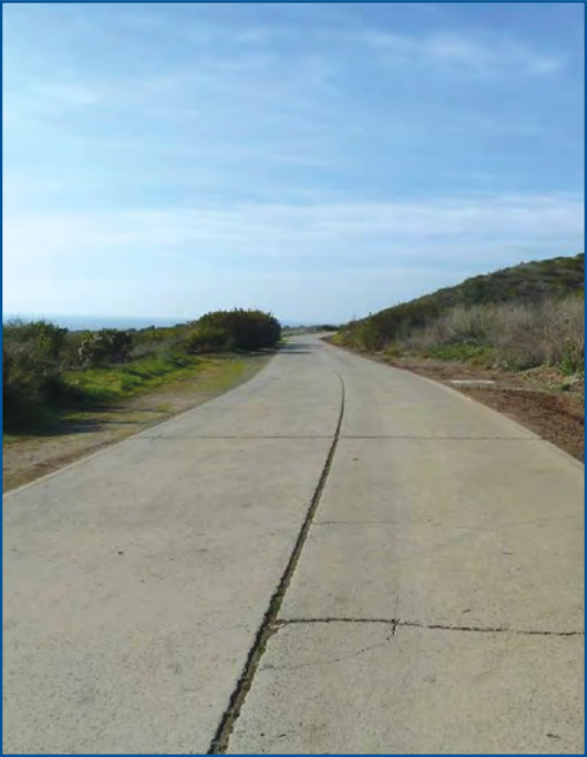
Old California State Route 2, Marine Corp Base Camp Pendleton.

Old State Route 2/US 101 served as the primary route along this part of the southern California coast until 1938, when the California Division of Highways (successor to the Highway Commission) chose a new route down on the flats closer to the coastline. Four years later, during World War II, MCB Camp Pendleton was created on a portion of the old Santa Margarita Ranch, including Old State Route 2. The engineering marvel of its day was no longer open to public use, but a portion of it has remained in good condition and is still in use on the base today.