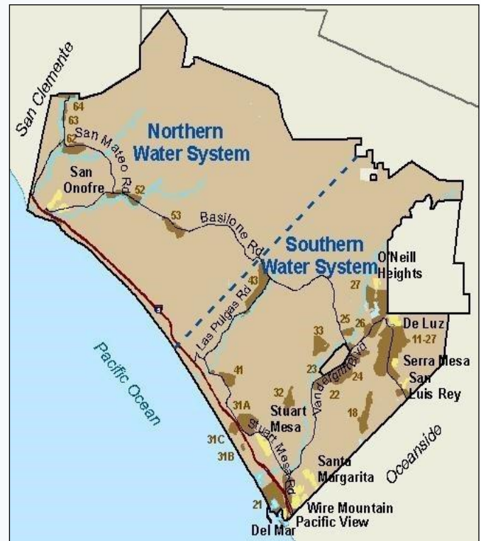
Camp Pendleton Water Service Areas

Southern Water System: Services the 43 Area and all areas south and southeast of Las Pulgas Road. Wells located in the Las Pulgas and Santa Margarita River basins supply water to this water system.