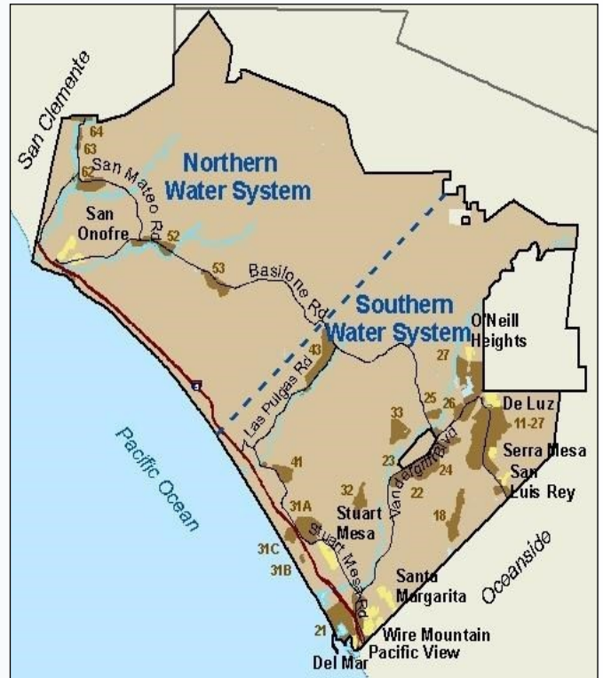
Camp Pendleton Water Service Areas

Southern Water System: Services the 43 Area and all areas south and southeast of Las Pulgas Road. Wells located in the Las Pulgas and Santa Margarita River basins supply water to this water system.