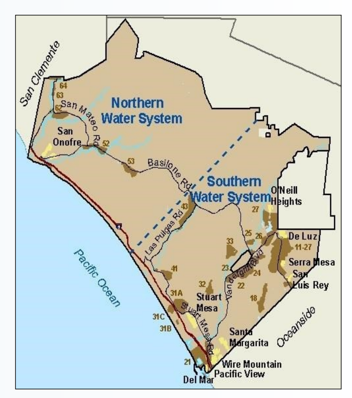
Camp Pendleton Water Service Areas

<u>Southern Water System</u>: Services the 43 Area and all areas south and southeast of Las Pulgas Road. Wells located in the Las Pulgas and Santa Margarita River basins supply water to this water system.