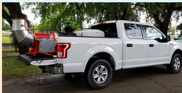
Mosquito control truck used for spraying larvicides

During an outbreak, local government departments and mosquito control districts take the lead for large-scale mosquito control activities to quickly kill larvae that hatch from eggs. Depending on the size of the outbreak, larvicides may be applied using handheld sprayers, trucks, or airplanes.